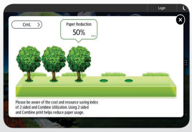
Eco-Friendly Indicator Screen as shown on the Smart Operation Panel.

Choose the Ricoh MP 2554SP/MP 3054SP/MP 3554SP for low cost-per-page and best in class typical electricity consumption (TEC) values to help support your budgetary needs and sustainability goals. With a shorter print/copy time from sleep mode, the Ricoh MP 2554SP/MP 3054SP/MP 3554SP keeps up with today's fast-paced business requirements. You can program the device to power on or off during specified times to conserve energy for even greater savings. Plus, the device meets EPEAT® Gold criteria — a global environmental rating system for electronic products — and is certified with the latest ENERGY STAR™ specifications.